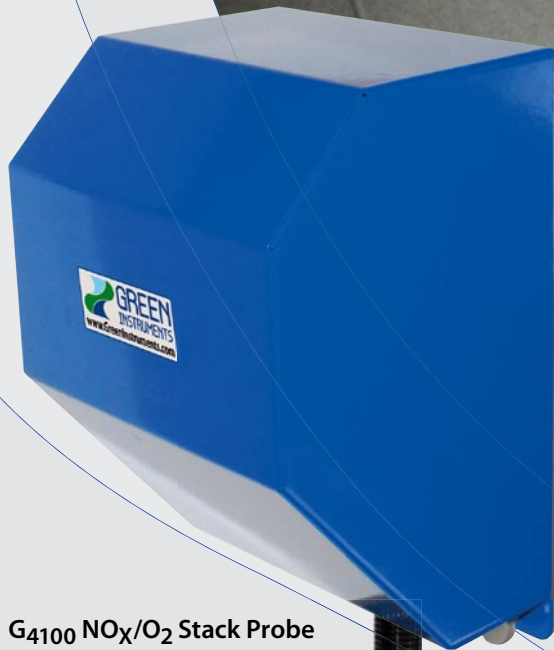
G4100 NO x /O 2 Stack Probe