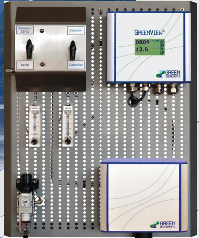
G4100 NO x /O 2 Analyzer Board