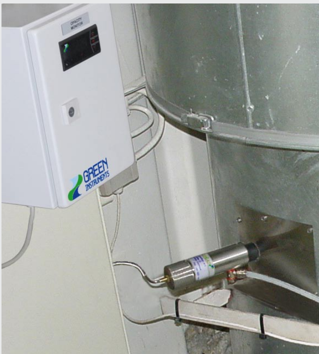
An installation of a G1000 Smoke Density Monitor with the monitoring unit and one optic head

Port authorities and regional authorities around the world – but especially in North America – are to increasing degrees regulating emissions from ships as well as from industrial plants. Although legislation is varying, regulations in North America would typically rule that ships may not emit smoke with an opacity of more than 20% for more than 3 minutes. A similar limit is set for shipboard incinerators by IMO.