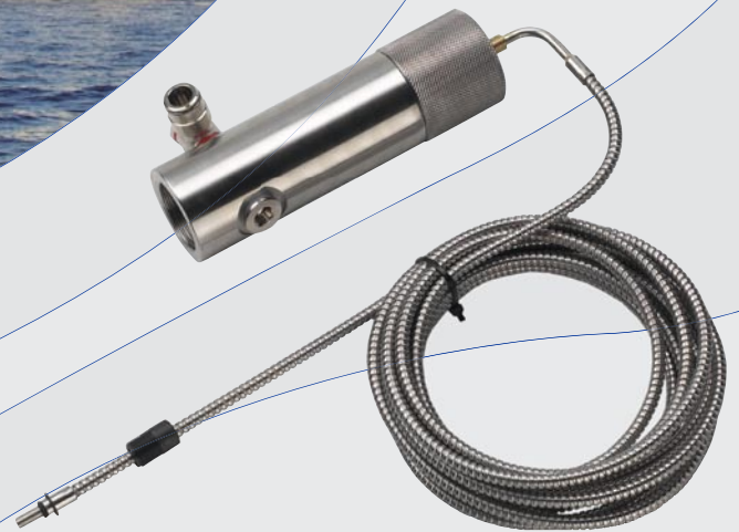
Optic head with fiber-optic cable

The G 1000 Smoke Density Monitor is a particular robust system that is well suited to resist heat and vibrations in and around smoke stacks. Our patented technology removes the light source from the smoke stack contrary to competing technology. Instead, the infrared LED is placed in the monitor cabinet and the light beam brought to the smoke stack via robust optic fibers. The lenses of the optic heads are kept clean with purge air.