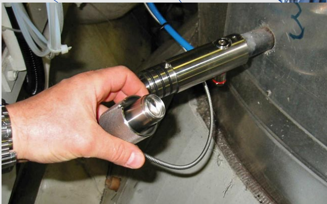
Easy lens cleaning